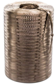
BASALT ROVING (1 TONNE)

Price: 0 UZS Construction materials, Roving Height (cm):15 Length (cm):15 Width (cm):20 Weight (kg):19