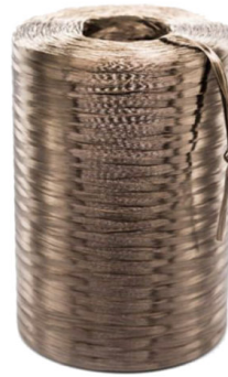
BASALT ROVING (SAMPLE)

Price: 13,000,000 UZS Construction materials, Wool Height (cm):400 Length (cm):120 Width (cm):250 Weight (kg):1000