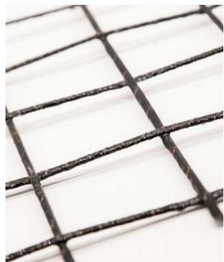
BASALT MESH (SAMPLE)