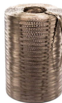
BASALT ROVING (1 TONNE)

Price: 0 UZS Construction materials, Roving Height (cm):15 Length (cm):15 Width (cm):20 Weight (kg):19