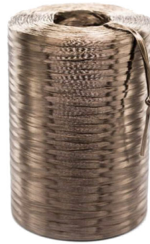
BASALT ROVING (SAMPLE)

Price: 13,000,000 UZS Construction materials, Wool Height (cm):400 Length (cm):120 Width (cm):250 Weight (kg):1000