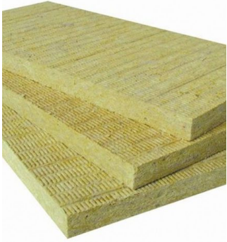
BASALT WOOL (SAMPLE)

Price: 0 UZS Construction materials, Wool Height (cm):15 Length (cm):15 Width (cm):20 Weight (kg):19