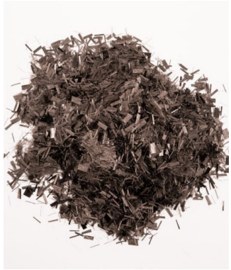
BASALT FIBER (SAMPLE)