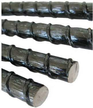
BASALT REBAR 8 MM (SAMPLE)