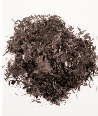
BASALT FIBER (1 TONNE)