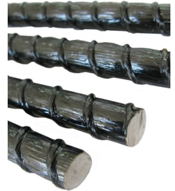
BASALT REBAR 6 MM (1 TONNE)

Price: 0 UZS Construction materials, Rebar Height (cm):15 Length (cm):15 Width (cm):20 Weight (kg):19