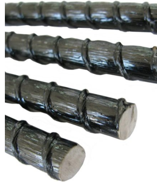
BASALT REBAR 6 MM (SAMPLE)

Price: 13,000,000 UZS Construction materials, Rebar Height (cm):400 Length (cm):120 Width (cm):250 Weight (kg):1000