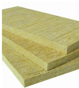
BASALT WOOL (SAMPLE)