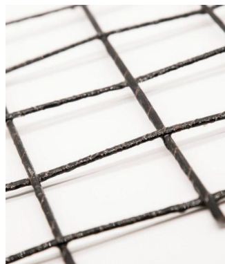
BASALT MESH (SAMPLE)