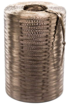
BASALT ROVING (1 TONNE)

Price: 0 UZS Construction materials, Roving Height (cm):15 Length (cm):15 Width (cm):20 Weight (kg):19