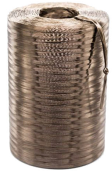
BASALT ROVING (1 TONNE)

Price: 0 UZS Construction materials, Roving Height (cm):15 Length (cm):15 Width (cm):20 Weight (kg):19